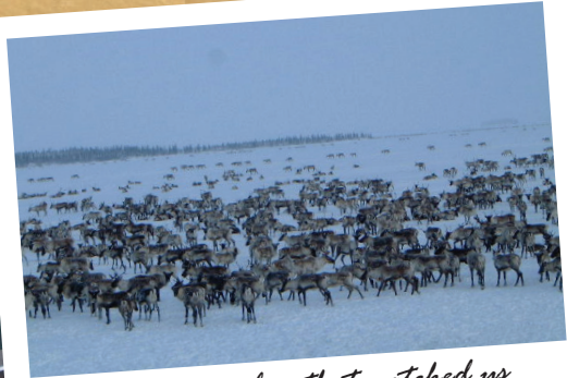
"A herd of caribou that watched us curiously as we photographed them."

to know the most distinctive festivals and the most beautiful locations offering local delicacies and access to the most exciting traditions.