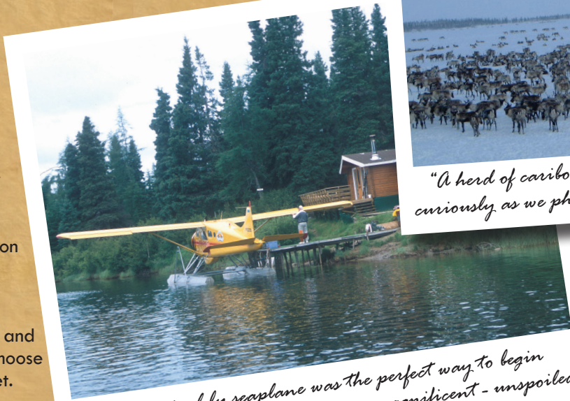
"Our arrival by seaplane was the perfect way to begin the trip. The view from the air was magnificent - unspoiled land that seemed to go on forever."

See the rugged coastline from a sea kayak or on foot where jagged rock walls tower thousands of feet with villages nestled in and around hundreds of coves, guts, bays and